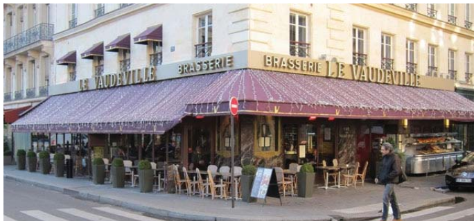
Brasserie Le Vaudeville